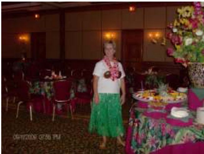
Friday Night Social – Island Time